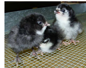
Brown Red Chicks